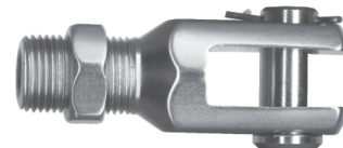
Head Cabeza Testa